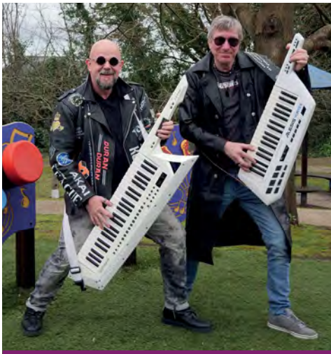
HardDrive at The Elizabeth Foundation