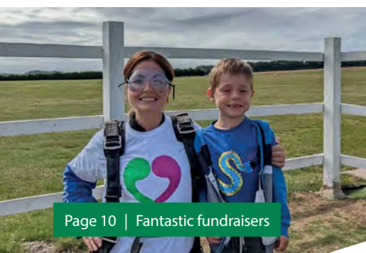
Page 10 | Fantastic fundraisers