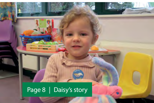
Page 8 | Daisy's story