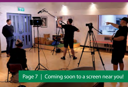
Page 7 | Coming soon to a screen near you!